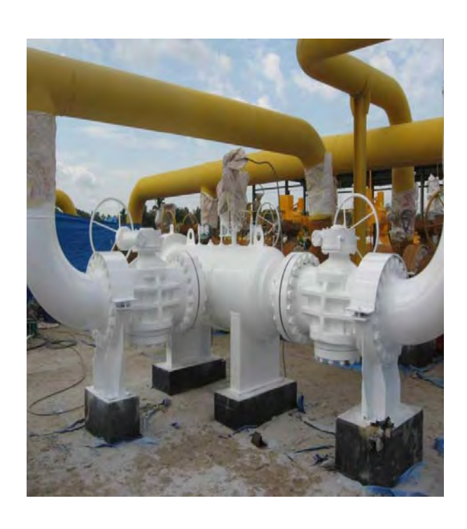
Application of Moist Metal Grip