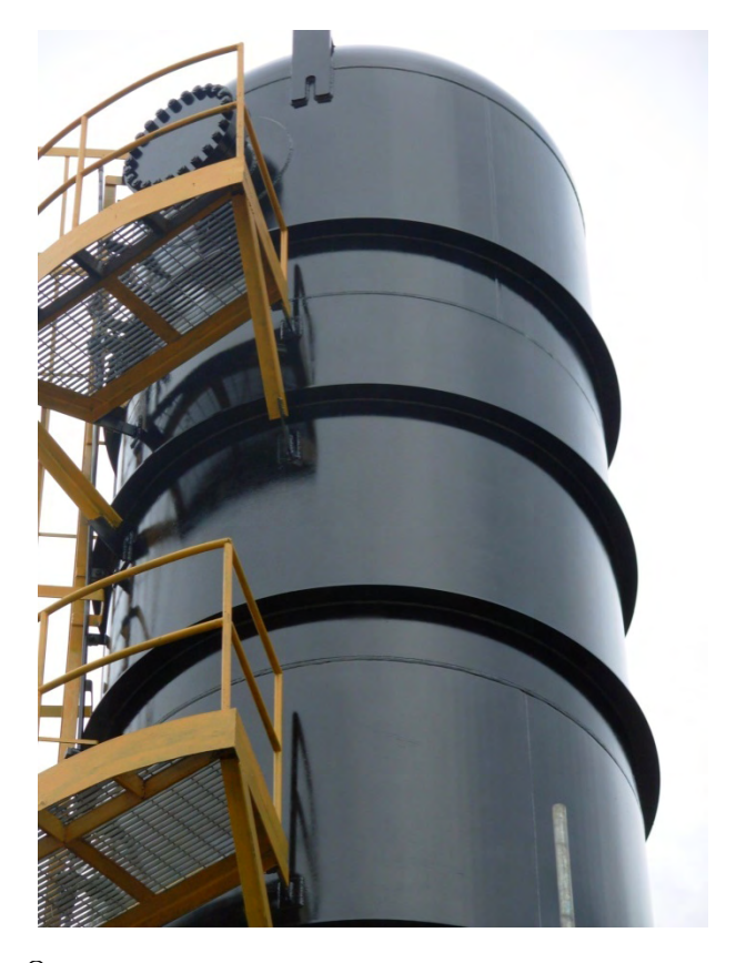
Completed Project - Rust Grip® and Enamo Grip (black)