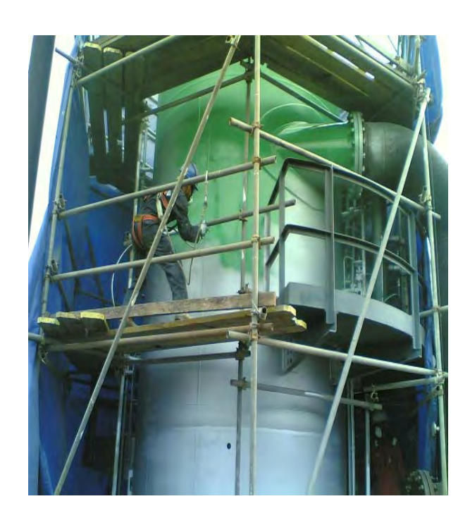
Enamo Grip (green) Application