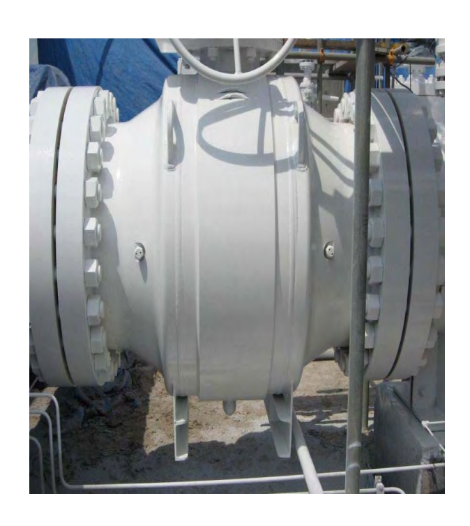
Application of Moist Metal Grip