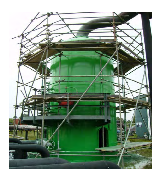
Completed Project - Rust Grip<sup>®</sup> and Enamo Grip