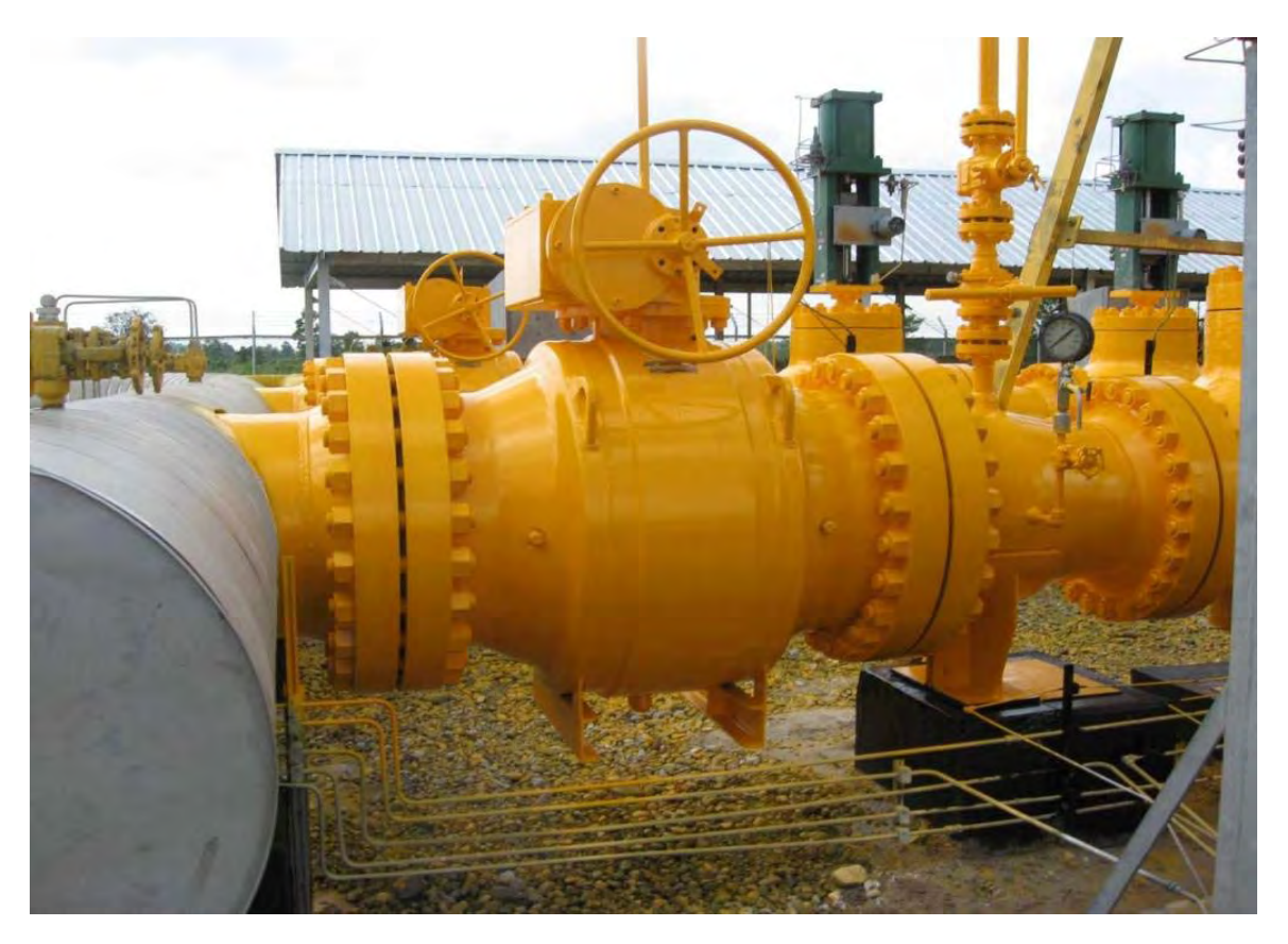
Application of Enamo Grip (safety yellow)